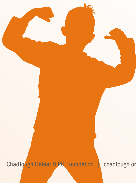
The Mosier Family